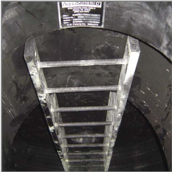
A permanent ladder provides access to filter chamber

Initially, the filter media is light tan or white in color. When the media color turns black, it has become saturated due to pollutant loading and requires replacement. Call toll free (888) 344-9044 to order replacement filters.