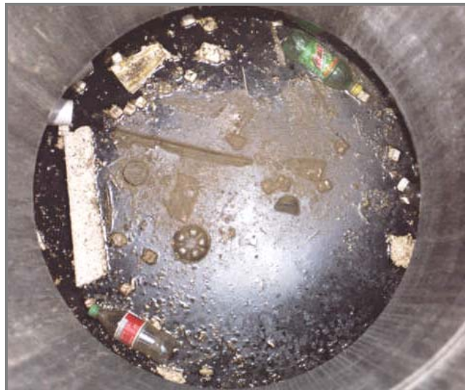
Floatable debris in the Aqua-Swirl™

The Aqua-Swirl™ is easily inspected from the surface. Floating debris and free oil can be observed along with the captured stormwater by removing the manhole cover. Sediment depth is determined by lowering a measuring device (e.g. stadia rod) to the top of the sediment pile.