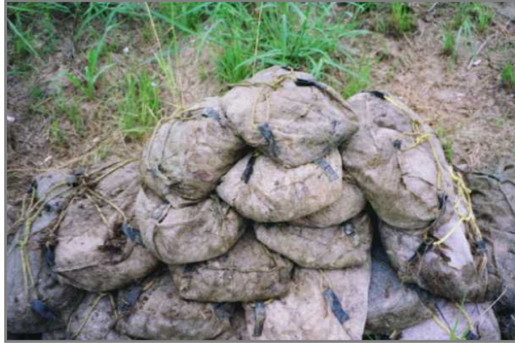
Spent filter media can be recycled or sent to a landfill

The spent filters and sediment generally do not require any special treatment or handling for disposal. The filtration media can be recycled as fuel material, or sent to a subtitle D landfill. AquaShield™ recommends that all materials removed during the maintenance process be handled and disposed of in accordance with local and state requirements.