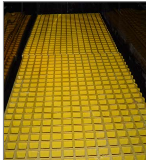
Grate panels cover the filter media

After the removable sides have been loaded with replacement filter containers, the removable center grates are repositioned and locked in place. New filters are installed in a criss-cross manner to prevent short-circuiting.