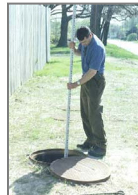
Sediment inspection using a stadia rod

To inspect the Aqua-Swirl™, a hook is needed to remove the manhole cover. AquaShield™ provides a customized manhole cover with our logo to make it easy for maintenance crews to locate the system in the field. We also provide a permanent metal information plate attached inside the access riser, which provides our contact information, the Aqua-Swirl™ model size, and serial number.