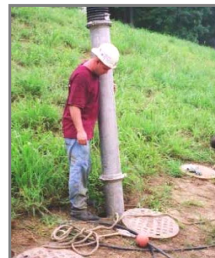
Vacuum truck cleans the Aqua-Swirl™

Disposal of the material is typically treated in the same fashion as catch basin cleanouts. AquaShield™ recommends that all materials removed be handled and disposed of in accordance with local and state requirements.